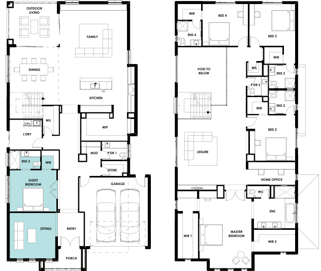
GUEST BEDROOM OPTION 2 OPTION