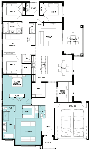
LOUNGE TO FRONT OPTION