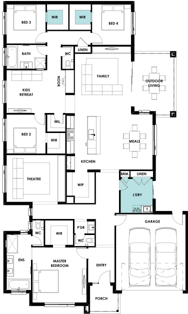
ALTERNATE LAUNDRY ILO HOME OFFICE OPTION