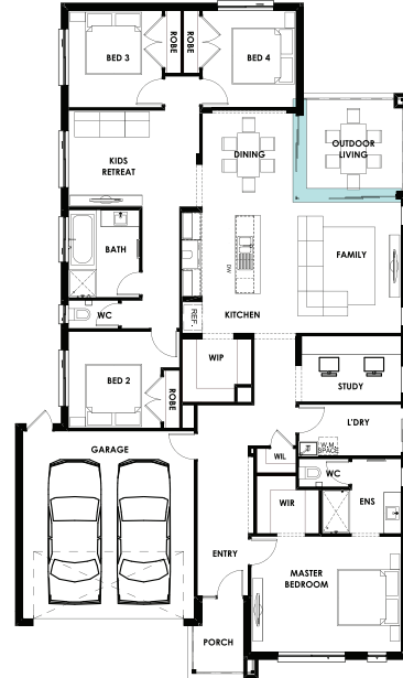
CORNERLESS SLIDING STACKER DOORS TO OUTDOOR LIVING