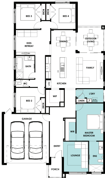
LOUNGE TO FRONT OPTION